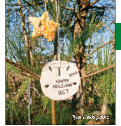
In December, Tyler Fields decorated evergreens along trails with "critter-edible" ornaments, all part of the "Find the Tree" challenge to BCT Facebook followers.